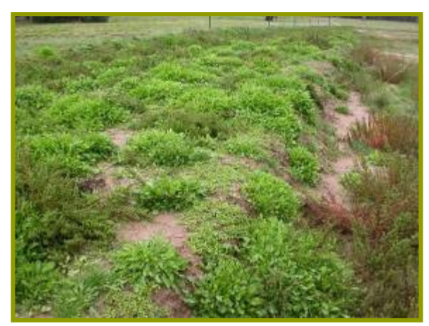
Figure 3 Note the heavy weed load that emerged from the topsoil pushed back from the scrape at our Laharum site.

In September we'll be again hoping the weather is kind and that we can get onto sites with our machinery to sow - and that this will be followed by good spring rain! I hope we will be able to conduct at least two field days in the months following our sowing so we can gather those interested in the techniques we are investigating and show them some of our outcomes to-date.