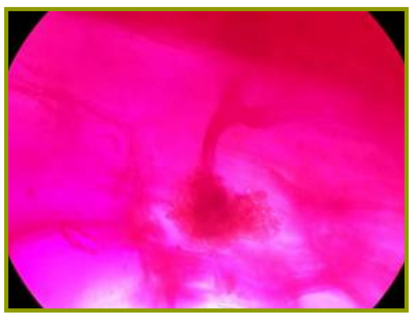
Figure 1: A highly magnified image of an AMF arbuscule(and hyphae) in Kennedia prostrata (Running Postman). These structures are thought to be the site of nutrient exchange between the AMF and its plant host.

AMF are very common and occur throughout the world in association with most vascular plants as well as some bryophytes. AMF assist their host plants to acquire nutrients, in particular phosphorus, and to improve access to soil water. They may also confer disease resistance against soil borne pathogens. In return, the AMF acquires its sugars, derived from photosynthesis, from the host plant. The site of nutrient exchange is thought to be the arbuscule (Figure 1), a highly branched hyphal modification that invaginates the plasma membrane of the plant root cell, a bit like a hand inside a rubber glove. They store sugars in spores and, if present, vesicles.