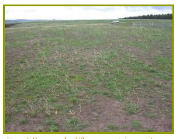
Figure 1 Grasses and wildflowers seem to be competing well in the 2 year weed control plot at Neville Oddies.

Hello again. This update comes with the GGRP just a few months out from our final sowing of the thirteen sites. I pose the question once more - how did we get here so quickly? I will give a very brief rundown of what's been happening to-date. In general, most of our sites have come on really well in the past three months. In fact, I'm confident that the second year sowings which covered up to 4000m2 - will establish successfully over the next 12 months (Figure 1). At present, many plants and species are still emerging and most are still very small seedlings. However if these survive the next summer (and I'm confident most will), then these areas will be covered with a number of direct-seeded grassland species. This represents quite achievement.