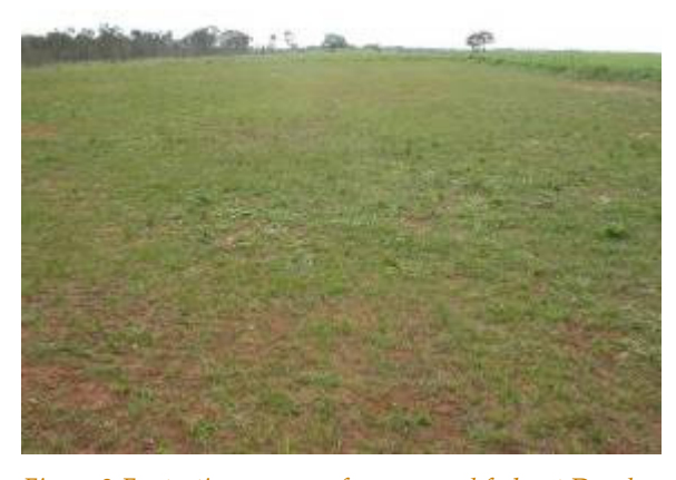
Figure 2 Fantastic coverage of grasses and forbs at Daryl Barbers Minyip site. This is on the scrape plot.

In terms of the weed control treatments we are looking at, it seems the areas that received two years weed control are still much weedier than the area where we scraped off topsoil - have a look at the picture in Jess's article of the Laharum site. However there are other sites, such as Neville Oddies Chepstowe and The Dennis's Colac sites, where the two year weed control