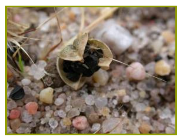
Figure 3 Chocolate Lily seed capsule

Most of the capsules release their seeds within the first month after harvest and even those relatively few capsules that failed to open after twelve weeks contained viable seeds.