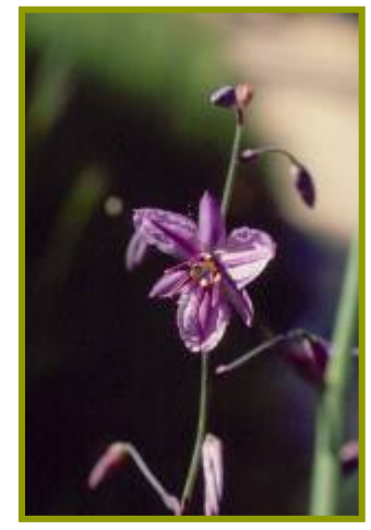
Figure 1 Chocolate Lily

and beautiful springflowering species that naturally in occurs plant grassy communities in southeastern Australia (Figure.1). It is a component of most of the seed mixes sown at the GGRP sites and the species is grown in a number of the seed production areas associated with the project (Figure 2).