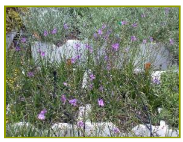
Figure 2 Chocolate Lily seed production boxes