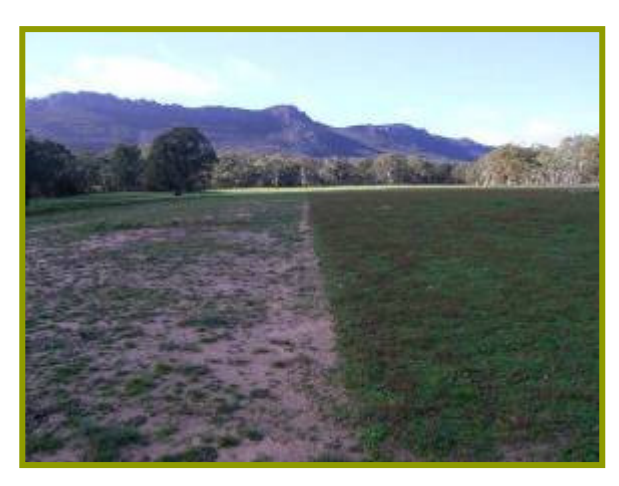
Laharum: scrape vs no scrape – a pretty clear result

20 of the 90 species sown here have emerged with the most recent arrivals being the bulbine lilies, bulbine bulbosa. This number probably doesn't sound as impressive as it should however with many of the species sown we don't expect them all to germinate at once. The idea being that we replenish the seed bank when sowing and allow the site to go through a natural succession process. In Paul's PhD trial work at Burnley college the Pimelea 's for example didn't emerge until three years after sowing. As with most of the sites the scrape is looking far better than the non-scrape with minimal weed cover.