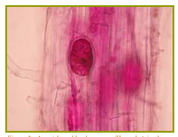
Figure 3: A vesicle and hyphae seen a Themeda triandra root cell.

Go to www.ffp.csiro.au/research/mycorrhiza/vam.html