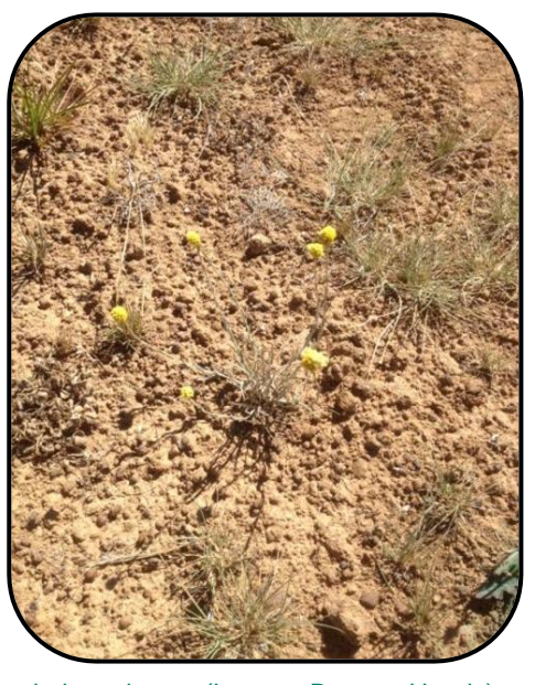
Calocephalus citreus (Lemon Beauty Heads) at Lake Bolac