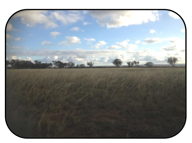
2011 and 2012 seedling sites (approx. 2 hectares)

Whilst there is still lots to be done to get the area back to its former pre-European glory; the results so far leave little doubt that a true link will be achieved in the not too distant future.