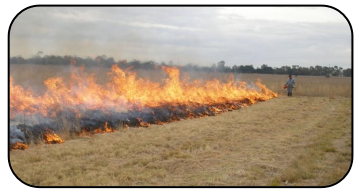
Rod White igniting the grassland. Containment lines were mown around the site and wetted down before the burn commenced

Follow-up maintenance to control any regeneration of weeds will be the focus over the coming months, particularly the later months of winter and early spring. The site will also be monitored to assess how the native flora species regenerate.