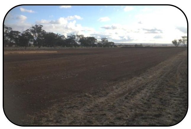
2013 seeding site ready to be sown in August (approx. 3 hectares)