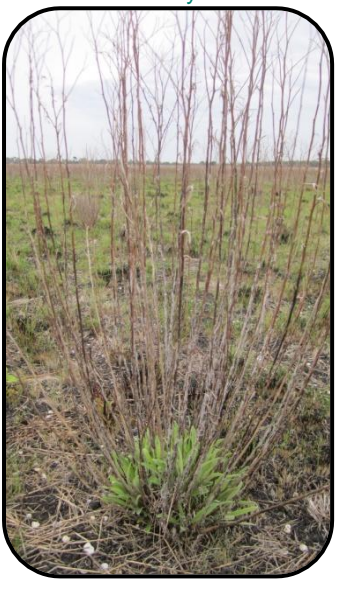
3 weeks after the burn Senecio quadridentatus (Cotton Fireweed) is regenerating along with Themeda triandra (Kangaroo Grass)