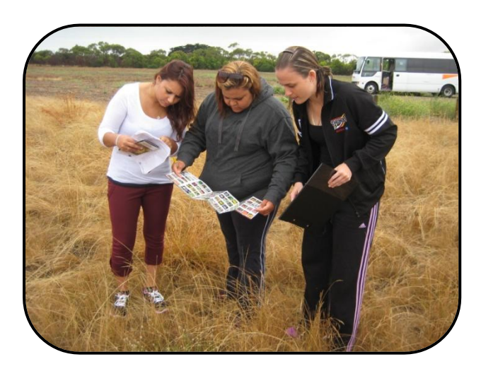
Below: A group of students identifying flora species within the grassland