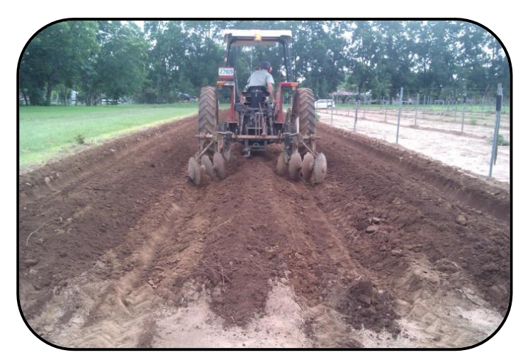
Preparing the site for an in-ground seed production area

So, on that note I implore our readers to continue to agitate decision makers in our funding agencies to focus less on grand, under resourced and therefore unrealistic landscape restoration targets, but rather provide the industry with legitimate support needed for localised improvements in seed and restoration infrastructure, which will be the key to achieving meaningful restoration outcomes.