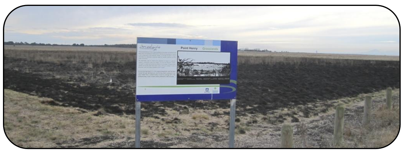
The burnt Moolapio grassland