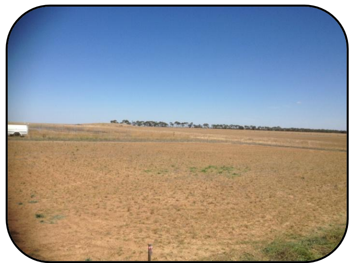
Lake Bolac – a good cover of grasses and herbs

Check their website for further information of upcoming events: <a href="https://www.sfs.org.au">www.sfs.org.au</a>