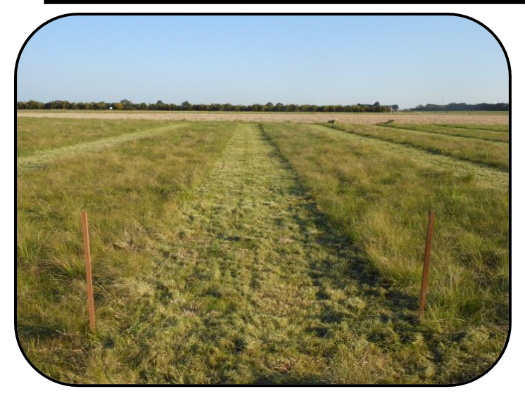
There are five mown plots 20m x 2m in size at Moolapio

Meanwhile, up on the Cumberland Plain (CP) to Sydney's west, we've begun to investigate this same question. With financial support from the NSW government's land development group Landcom and the University of Western Sydney (UWS), Greening Australia and UWS have teamed up to establish a study in a Cumberland Plain remnant adjoining a large new housing precinct (called The Ponds).