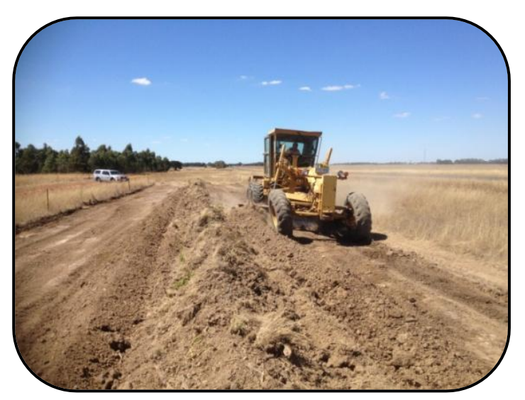
Scalping the site in preparation for sowing in August this year