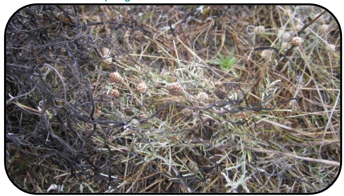
Calocephalus lacteus (Milky Beauty-heads) surviving the low intensity burn