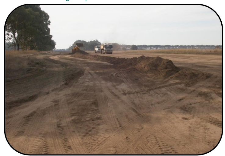
The site being scraped

I think the lessons learned are - that you can achieve anything if you set your mind to it, and to never give up. You need a strong group of individuals prepared to give their time, which they will do if you explain in detail what is required and keep them informed and involved. The local Shire could see it was a community effort, and was prepared to completely support the project to which I am very grateful and wish to express my thanks.