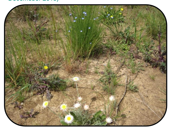
GEA 4: A years growth on the 5 hectare sowing in 2011, showcasing a variety of species. Leucochrysum albicans (Hoary Sunray), Linum marginale (Native Flax) and Podolepis jaceoides (Showy Podolepis) (Photo taken: December 2013)

With the Moolapio program winding down, the 350 seed production boxes will be planted out within the grassland with the help of a dedicated group of The Gordon (TAFE) conservation and land management students.