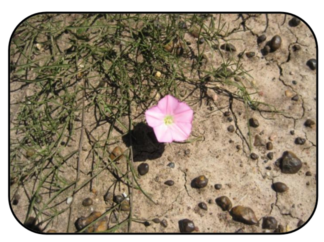
Convolvulus eurabescens (Common Bindweed)