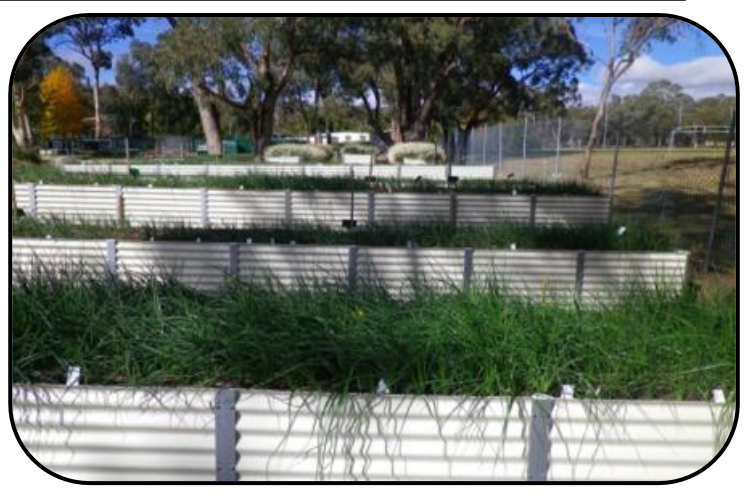
Completed raised garden beds at Greening Australia, Canberra