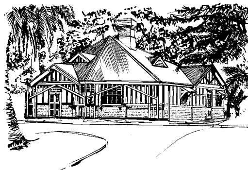
The Education Centre started life as the park's kiosk. Originally built in 1907, the centre was established after restoration was completed in 1997.

Feeding, and or handling of wildlife, is an offence under the National Park Regulations.