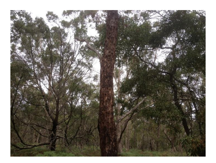
Yellow-bellied Glider Feed Tree on Weecurra Property

The property is owned by New Forests and around two thirds of the property is used commercially for growing Blue Gums. Approximately 10% of the property is native vegetation, and a further 24% of the property is not suitable for growing Blue Gums.